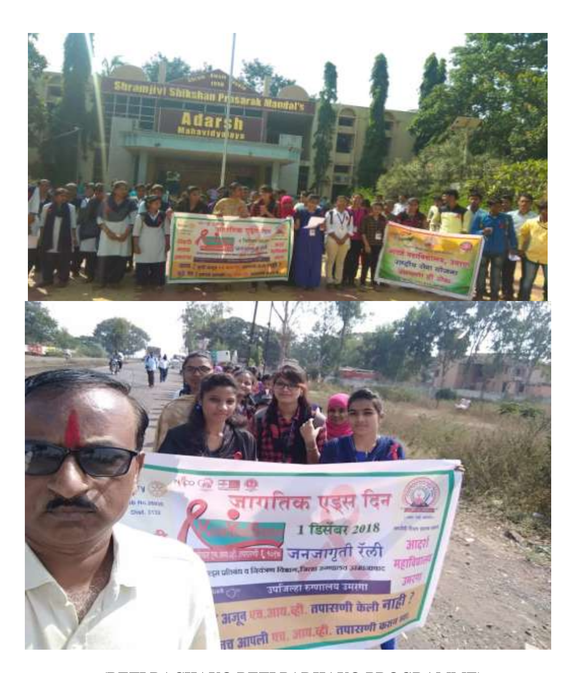
(BETI BACHAVO BETI PADHAVO PROGRAMME)