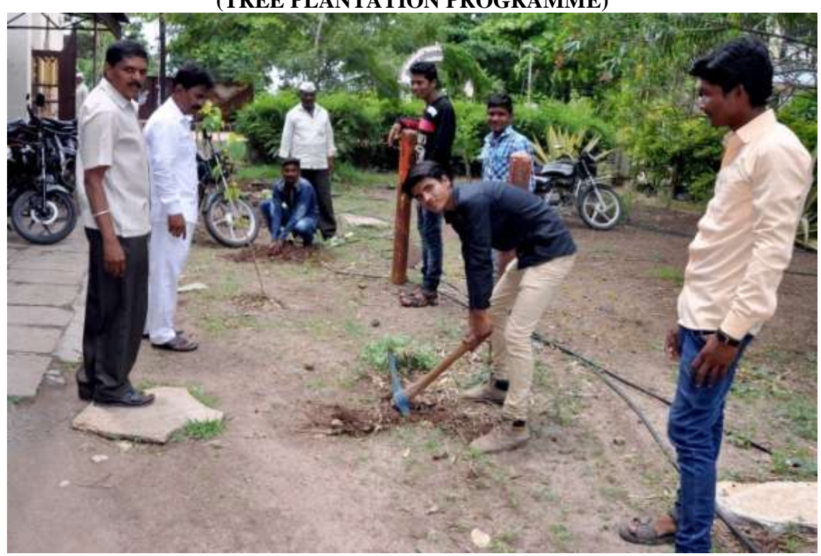
(TREE PLANTATION PROGRAMME)