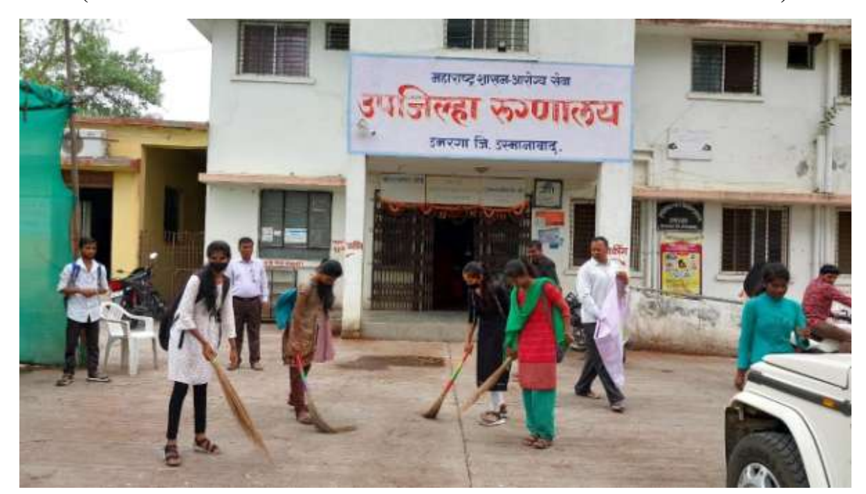
(SOCIAL EQUALITY AND UNITY PROGRAMME)