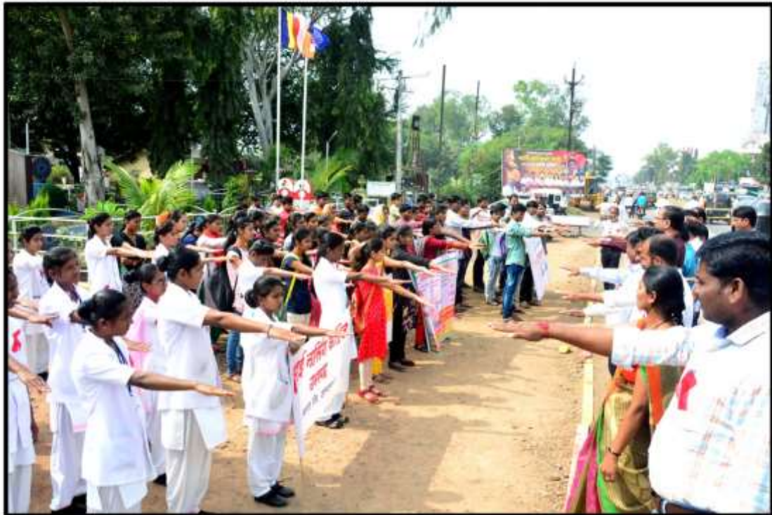
(AIDS AWARENESS RALLIES)