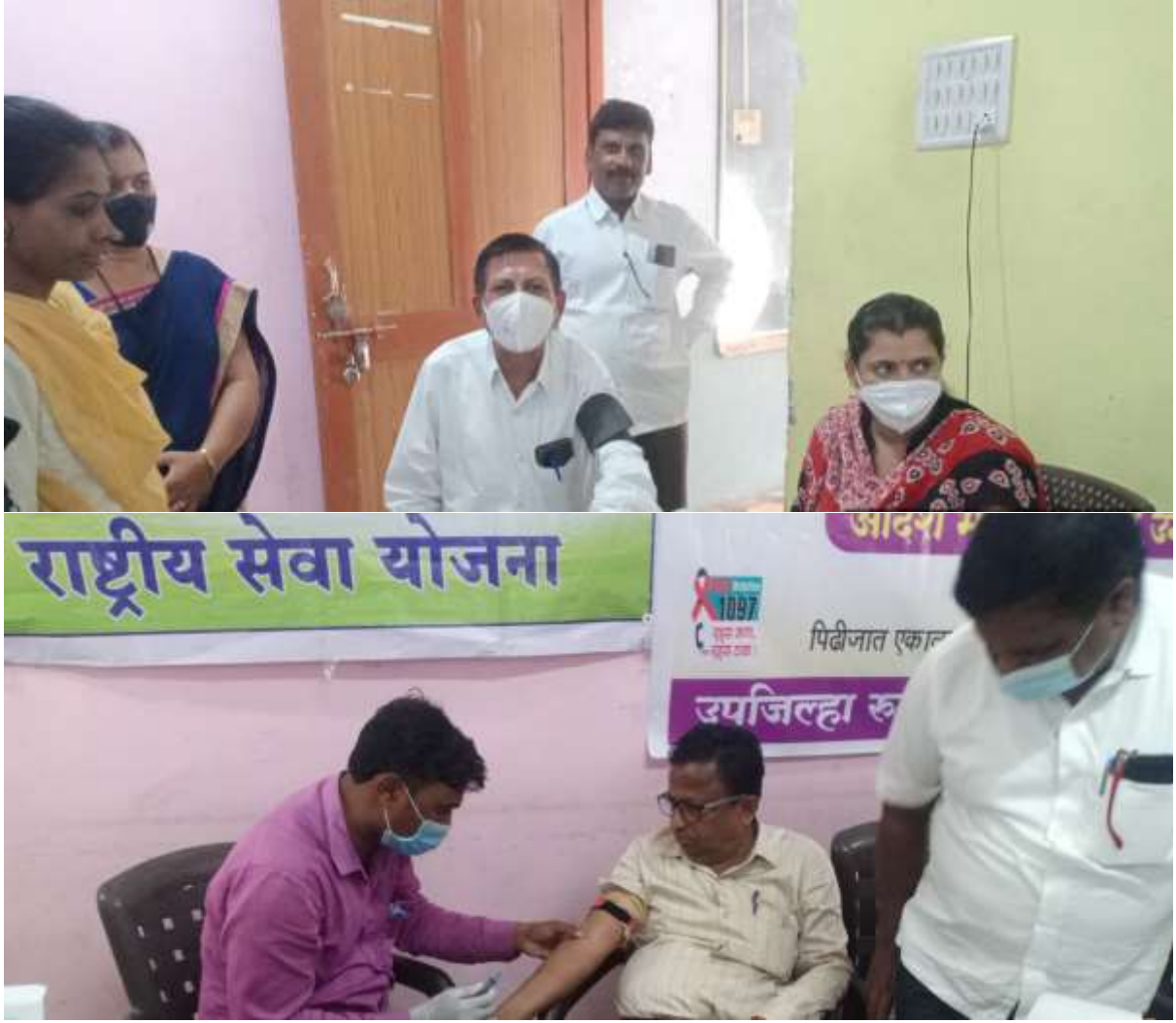
(HEALTH CHECK UP CAMP)