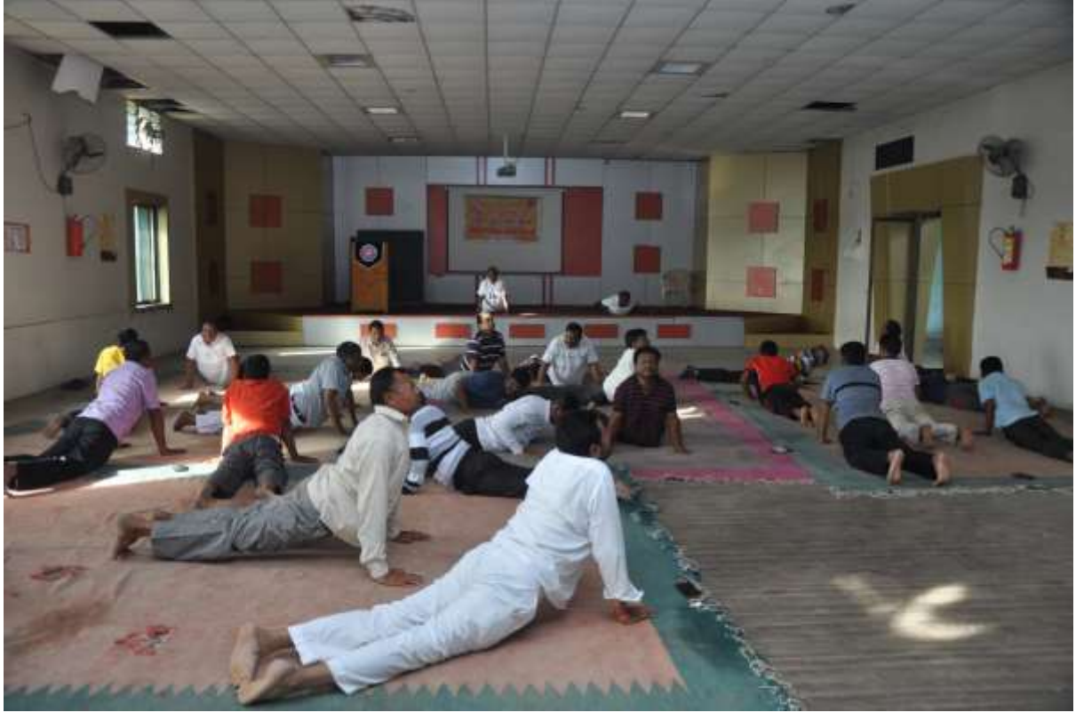
(YOGA DAY CELEBRATION)