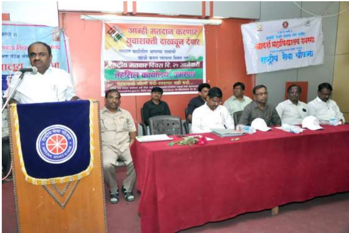
(VOTER'S AWARENESS RALLIES AND LECTURES)