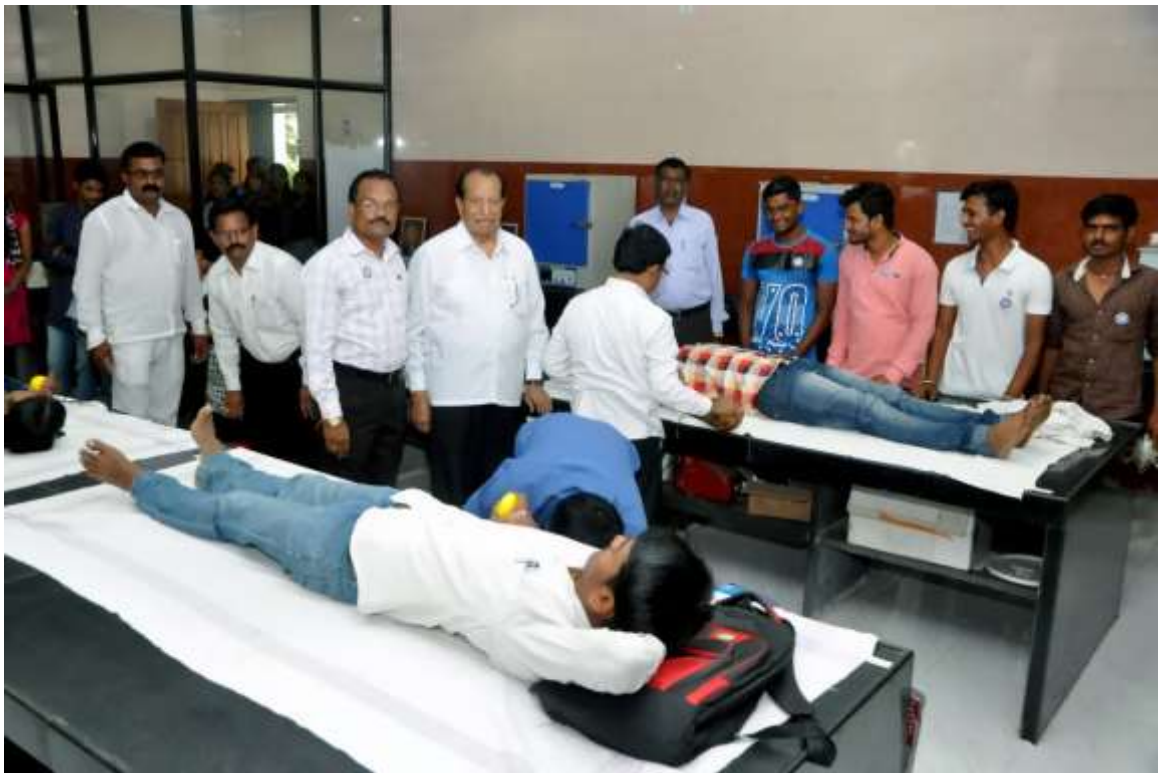
(BLOOD DONATION CAMPS)