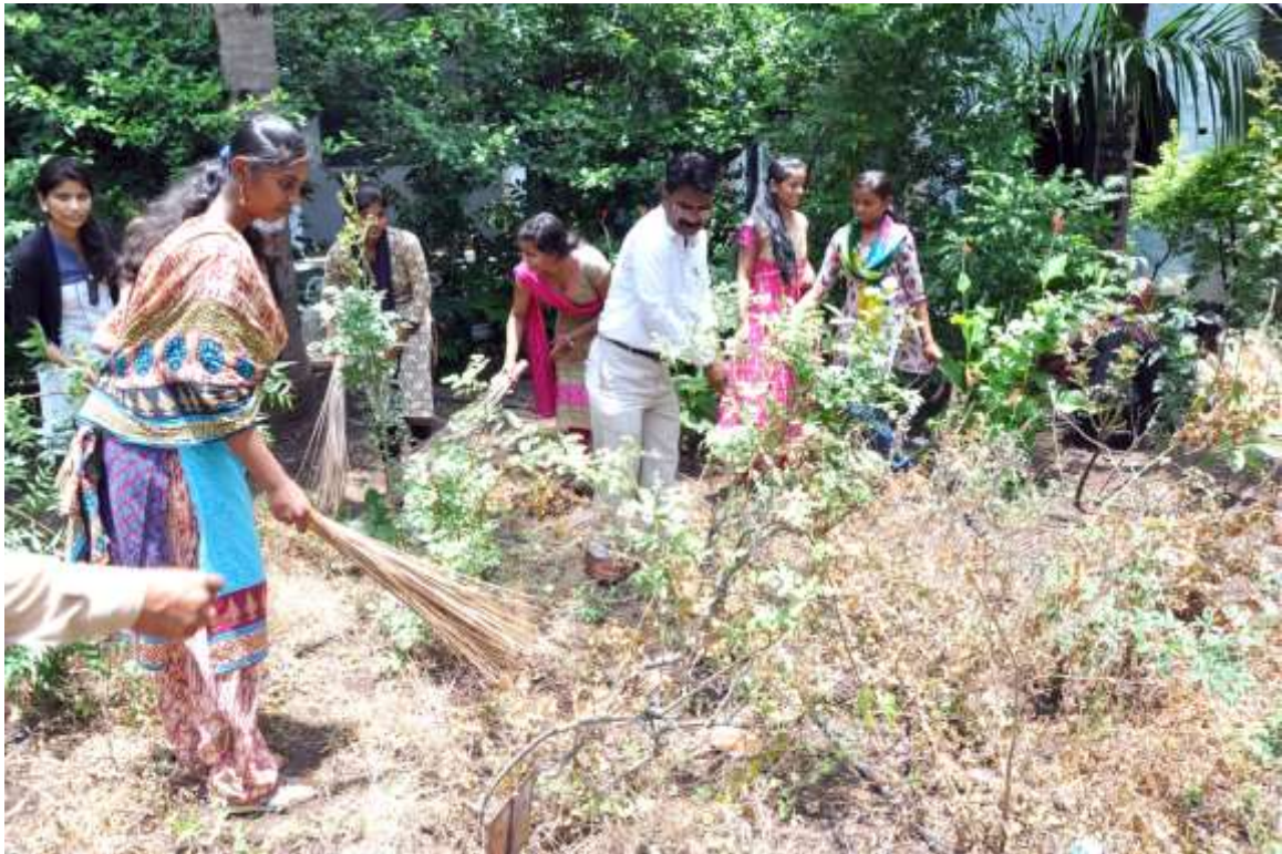
(SWACCHA BHARAT ABHIYAN)