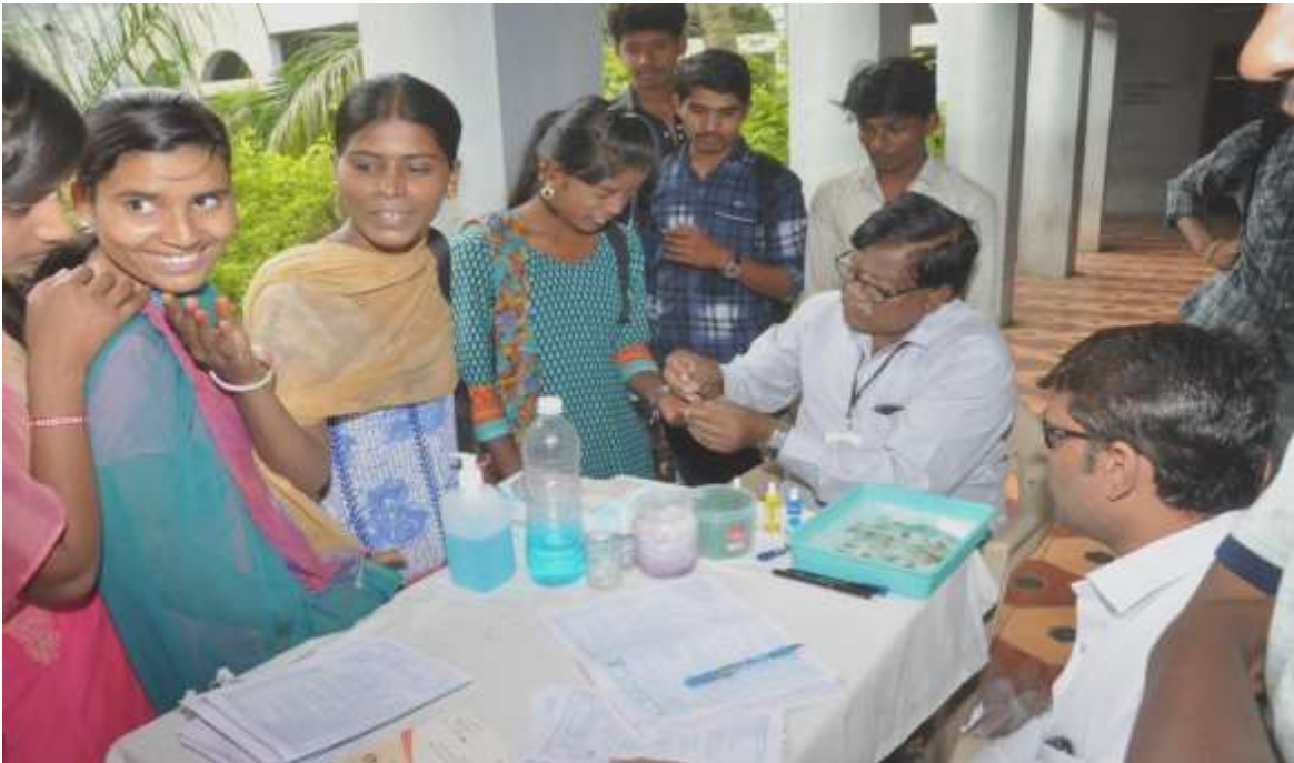
Blood group Checking program