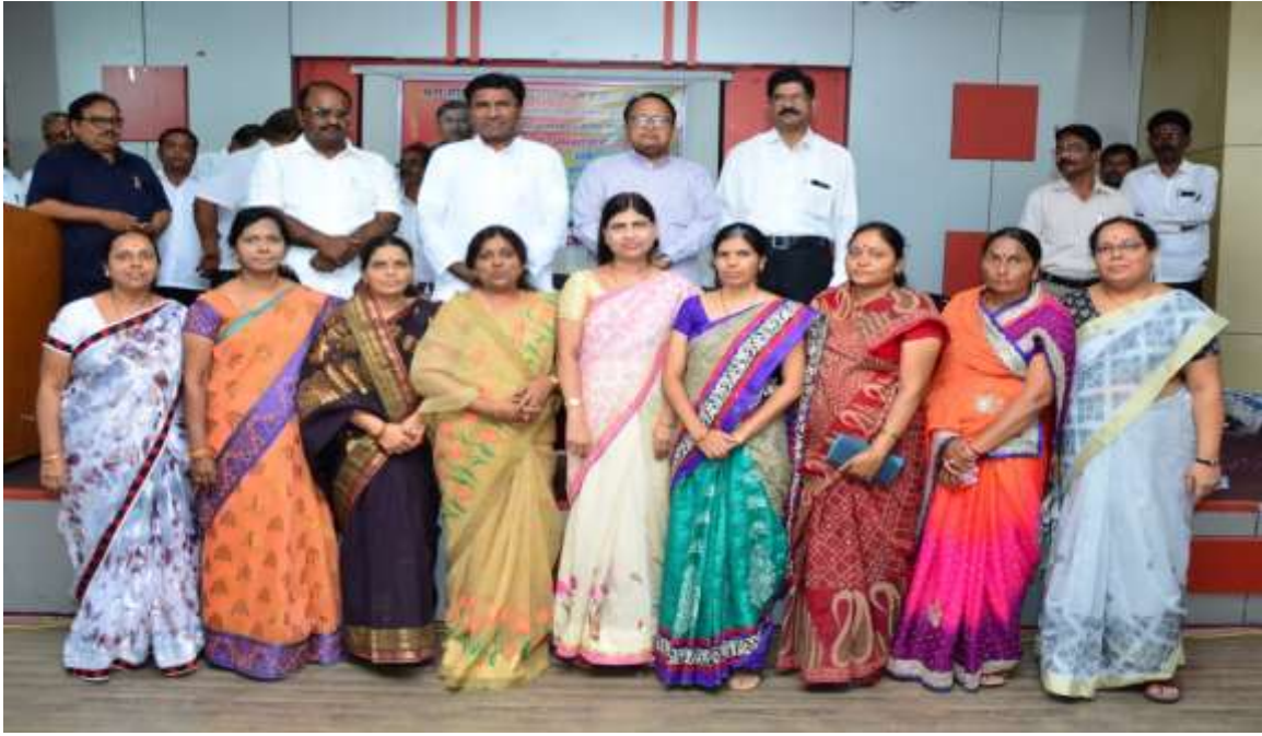
Our General Secretary Ex- minister of state Hon. Basavrajji Patil, on the occasion of women's day