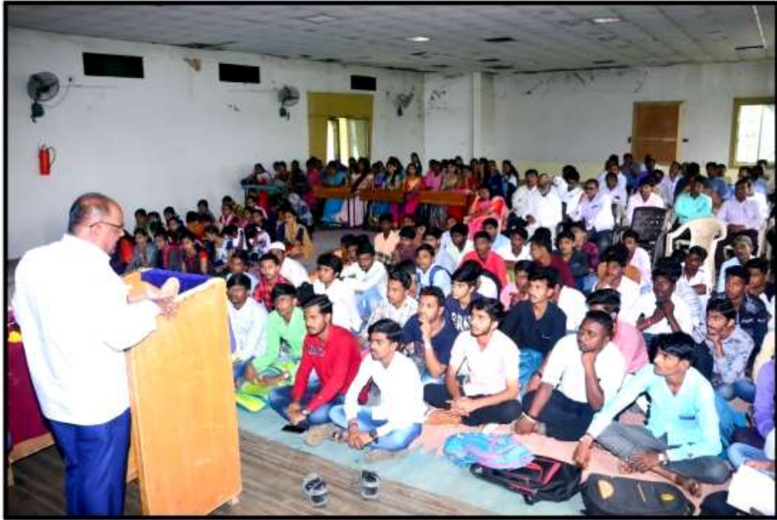
PRINCIPAL ADDRESSING ON THE OCCASSION OF HINDI DAY