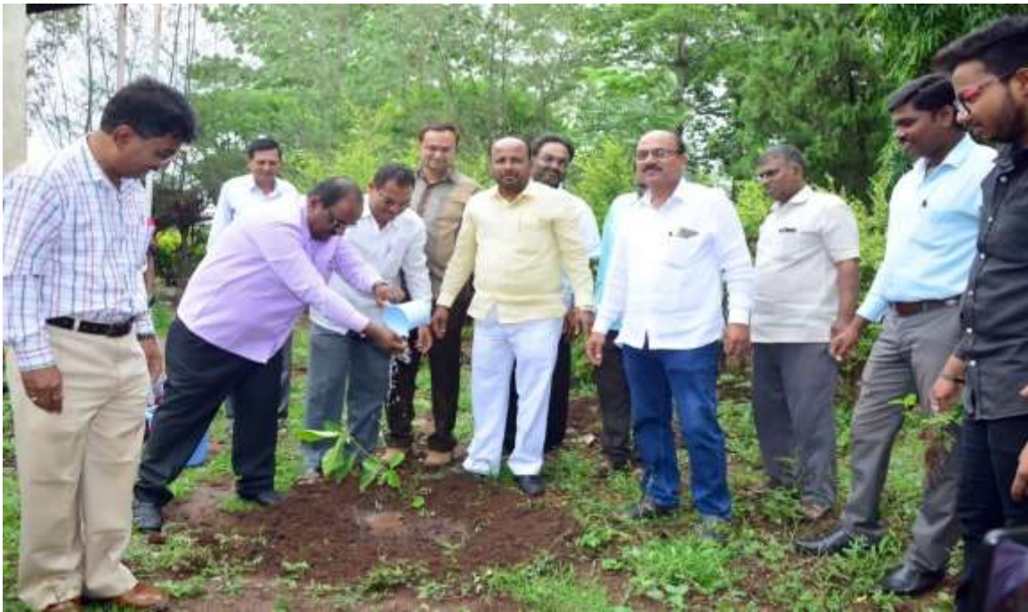
Principal and Staff members during plantation