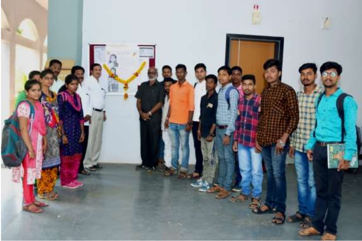
Wall Poster on Savitri Phule