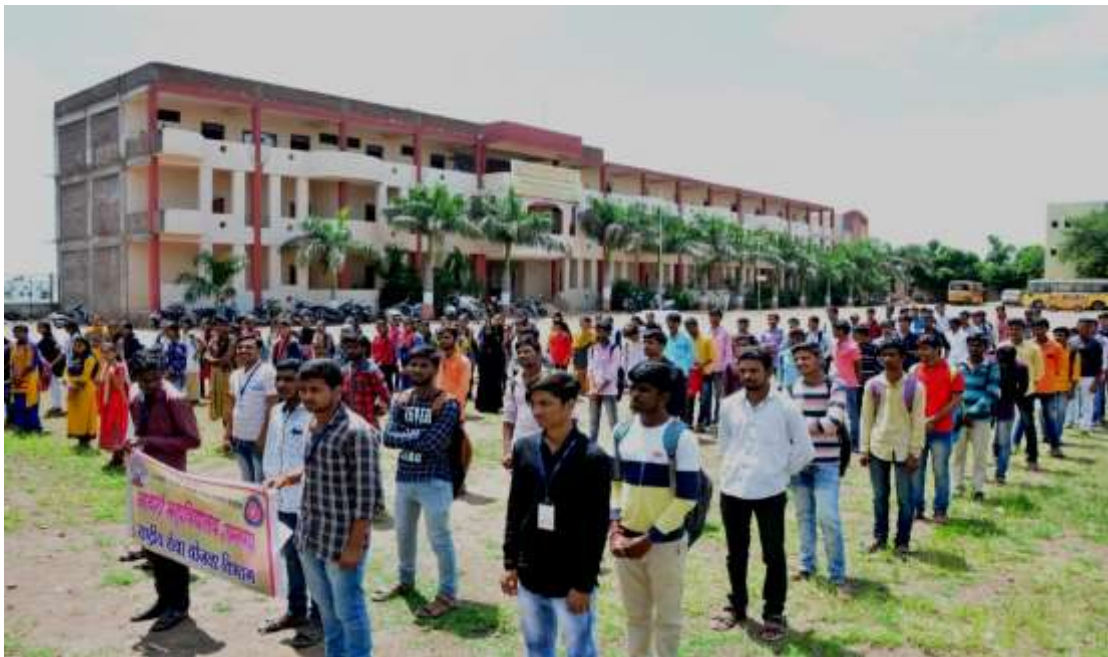
NSS students going to participate in money collection rally for flood affected farmers