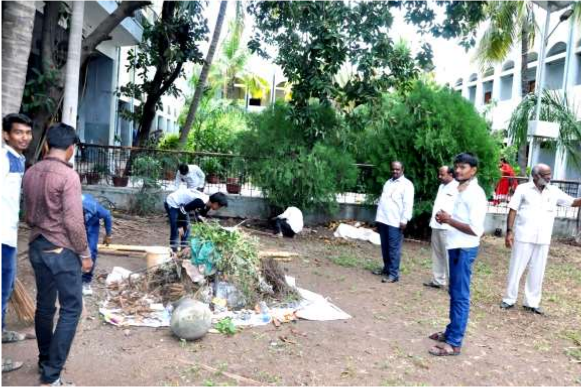
NSS students in Clean India movement Program