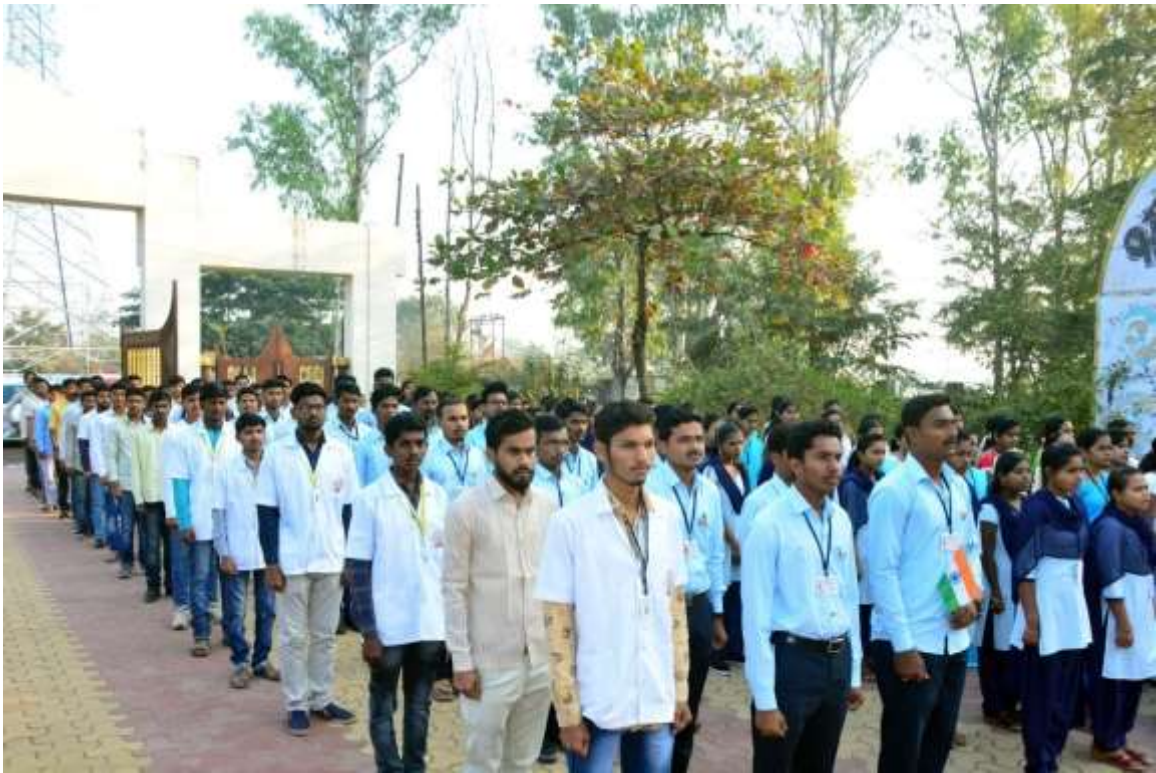
Students participated in Flag Hosting in Republic day