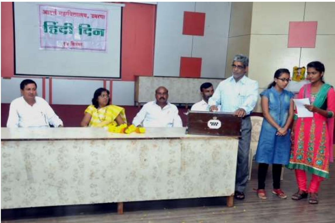
Hindi Day Program