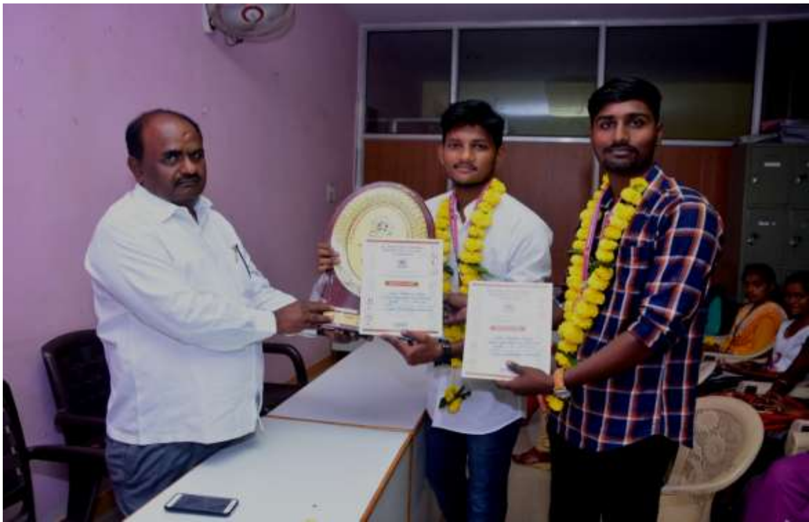
STUDENTS FELICITATION BY PRINCIPAL FOR ACHIEVING SUCCESS IN SPORTS AT UNIVERSITY LEVEL