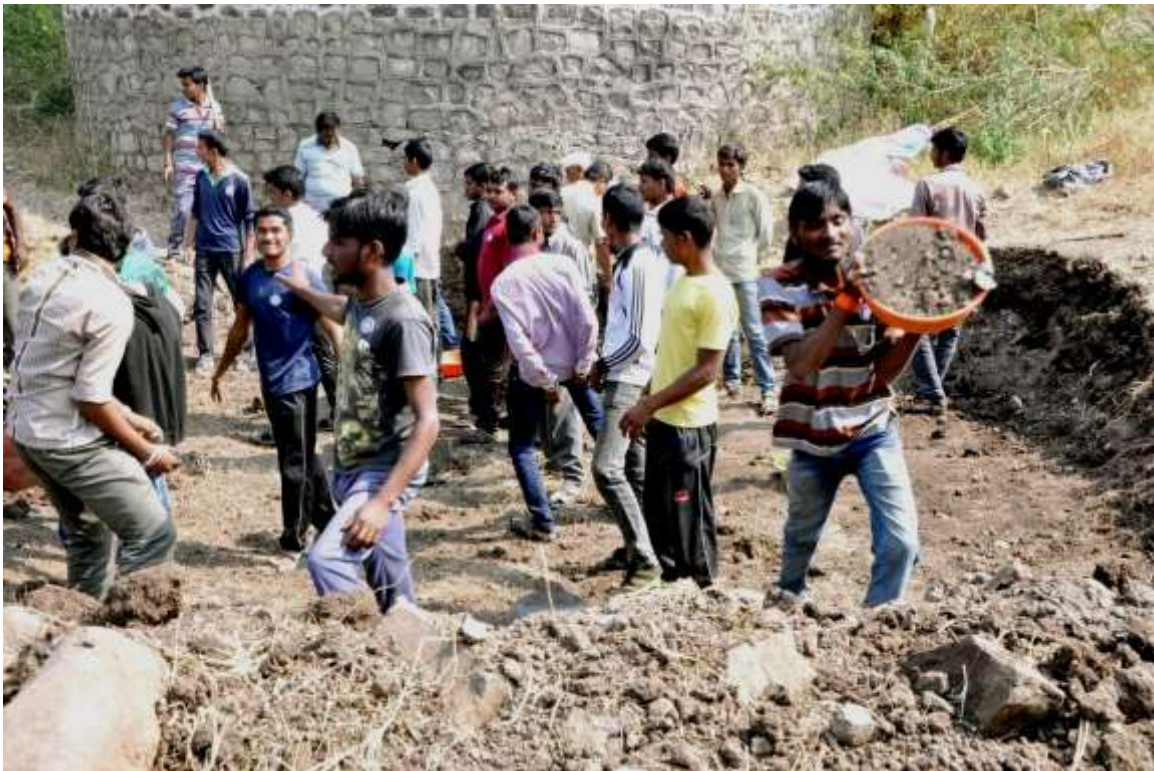
NSS students working at Jakekur village in NSS camp for construction of water conservation