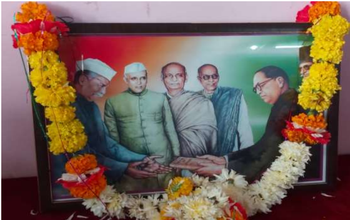
Indian Constitution Day