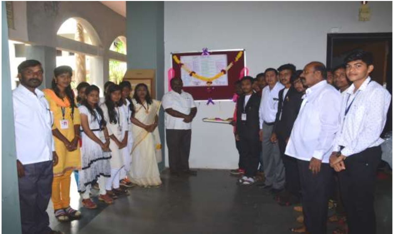
POSTER PRESENTATION ON THE OCCASSION OF HINDI LANGAUGE DAY