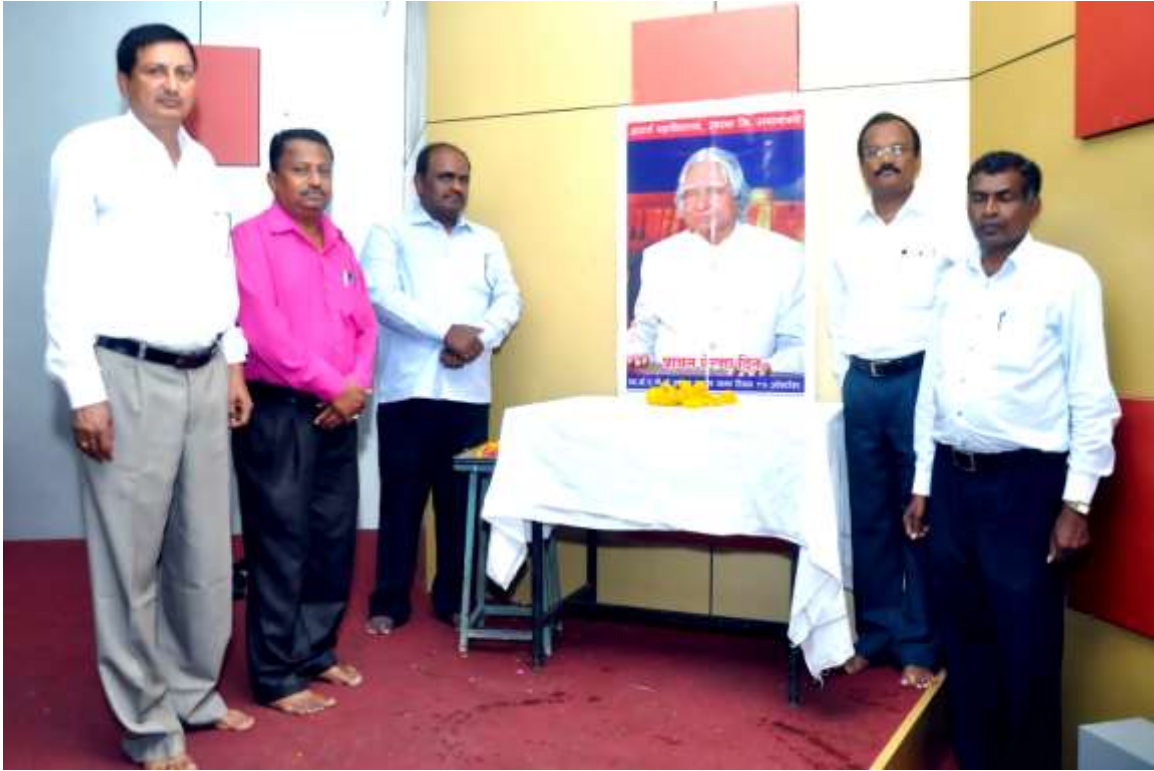
Reading Inspiration Day program on the occasion of Birth Anniversary of Dr. A. P. J. Abdul Kalam