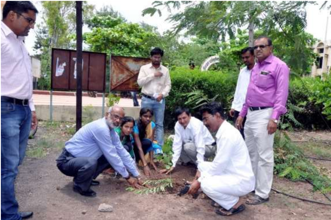
Students and Staff members during plantation