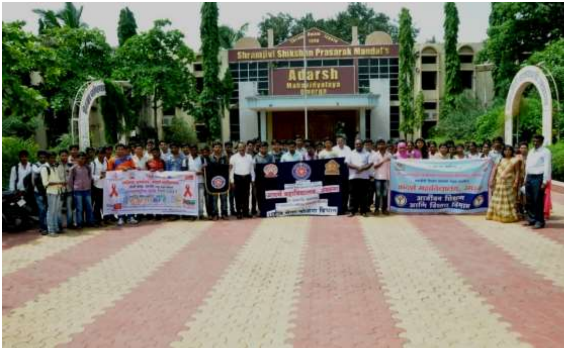
Organization of AIDS Awareness Rally