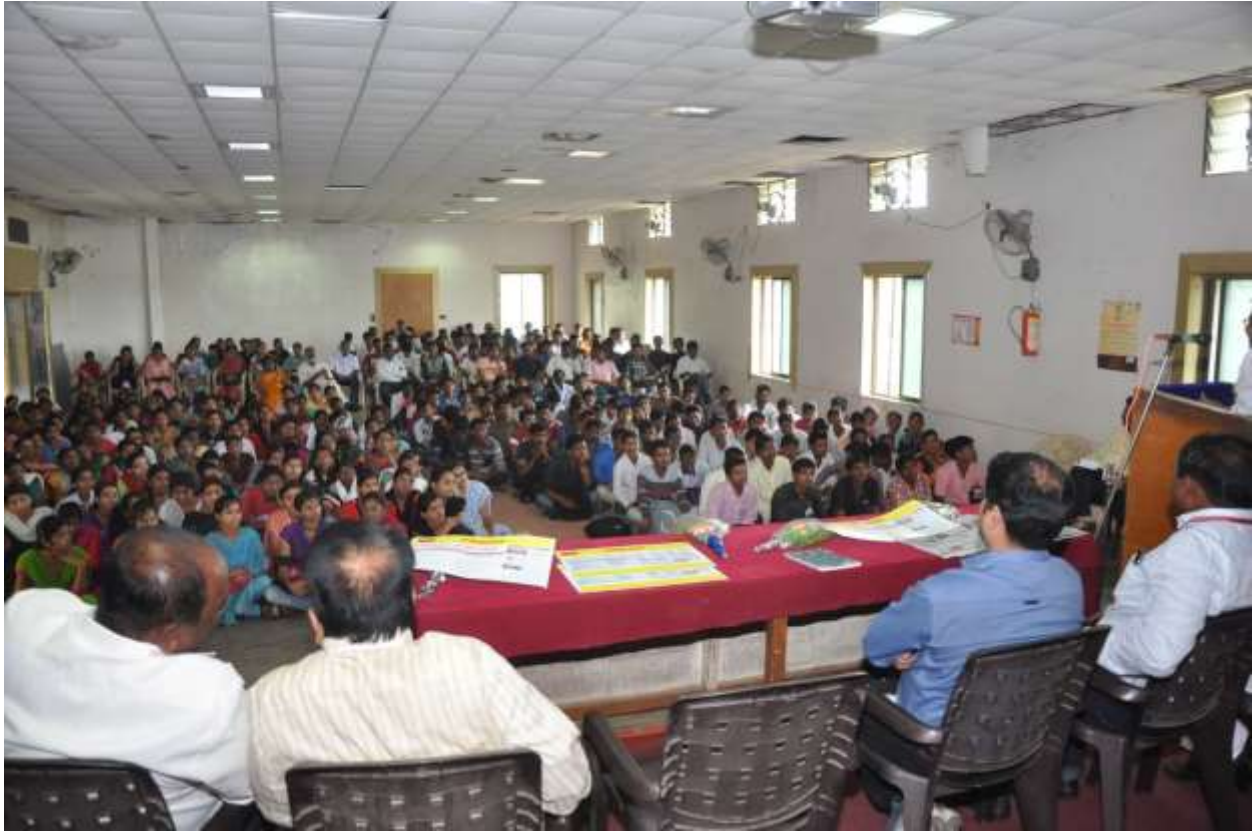
Competitive Exam Guidance Program