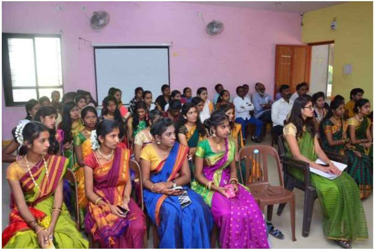
Girl students participated in Saree day program