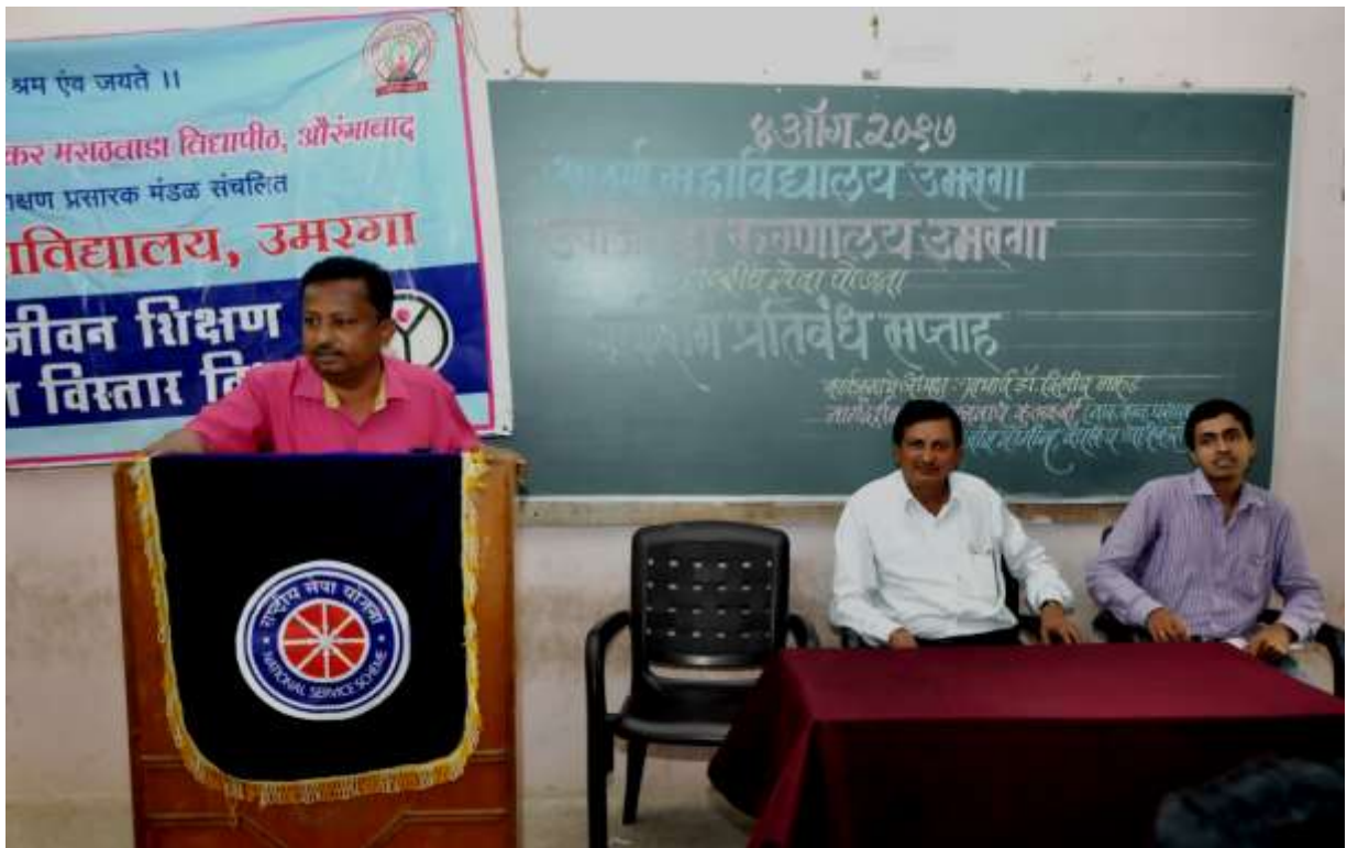
Cancer Prevention Week program