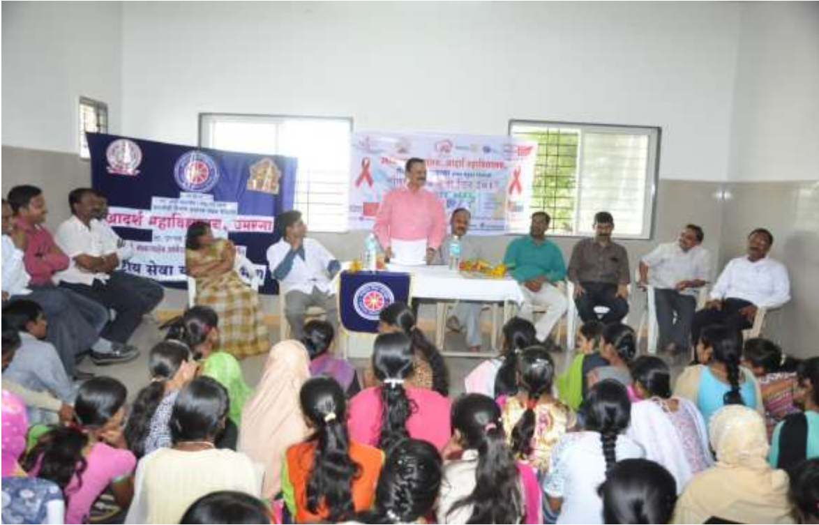
Medical Superintendent of Government Hospital, Omurga addressing after AIDS Awareness Rally in Government hospital