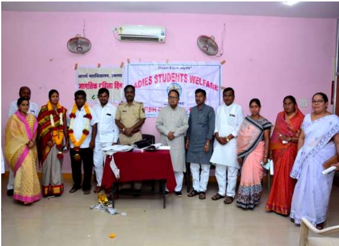
Police officer participated in the program World Women's Day