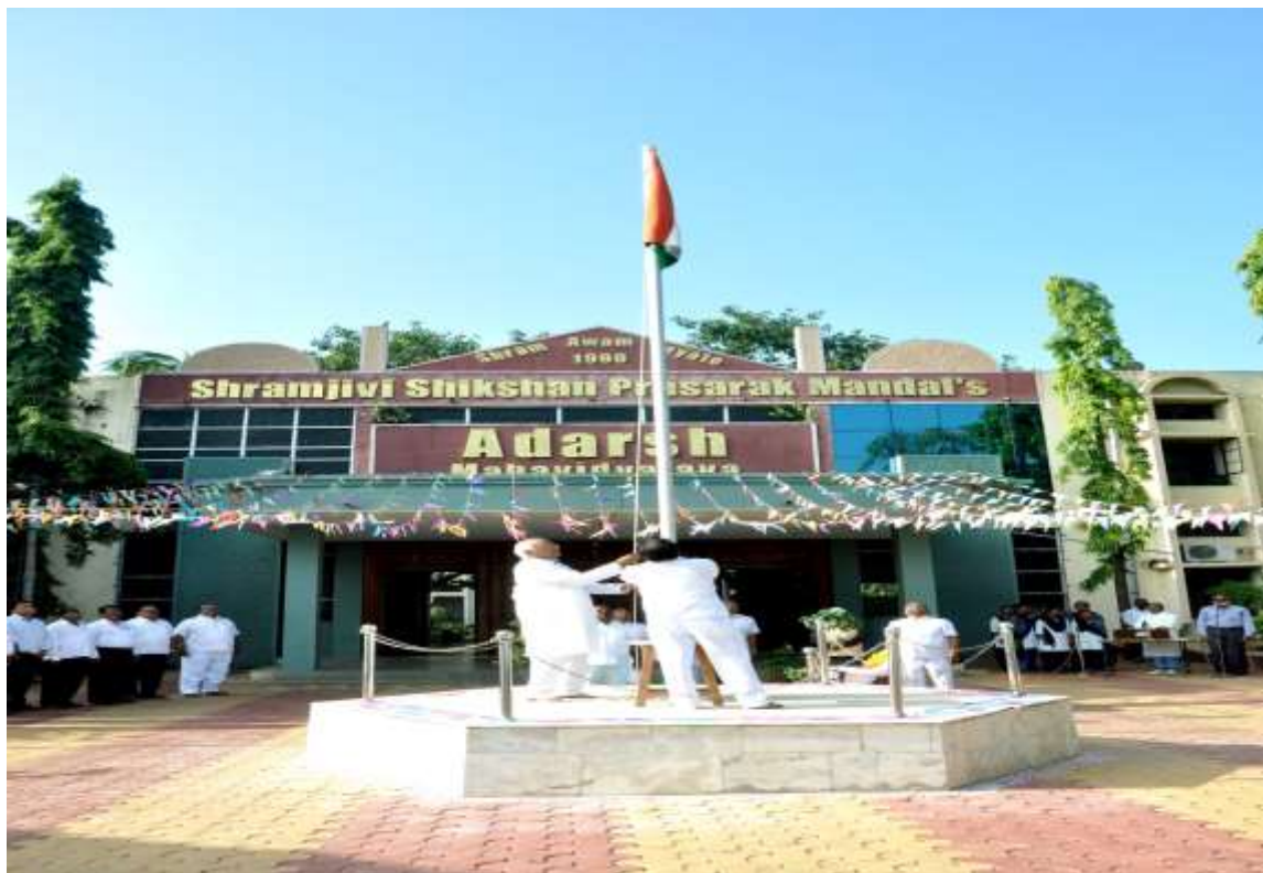
Flag hosting on Independence Day