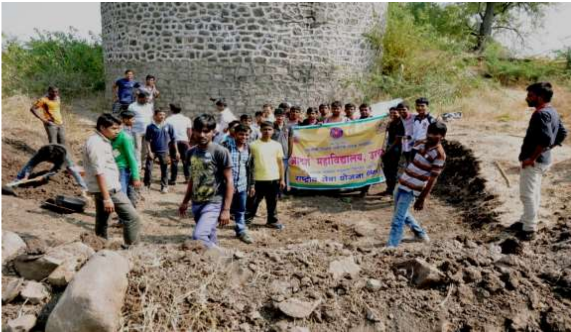
NSS students working at Jakekur village in NSS camp for construction of water conservation