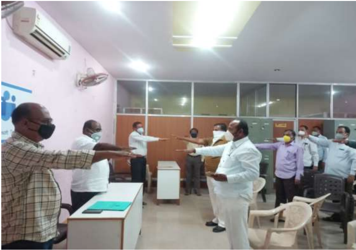
Principal giving oath in the program Indian Constitution Day