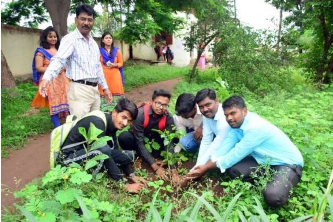
TREE PLANTATION IN THE COLLEGE CAMPUS