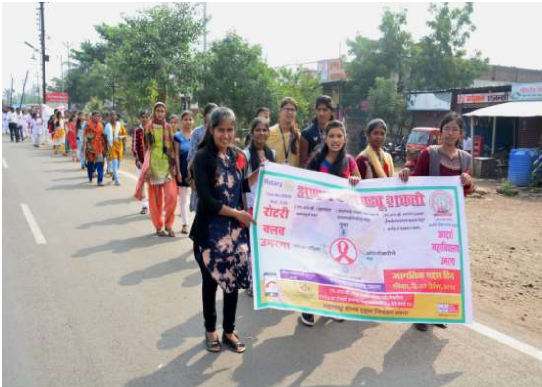
AIDS AWARENESS RALLY