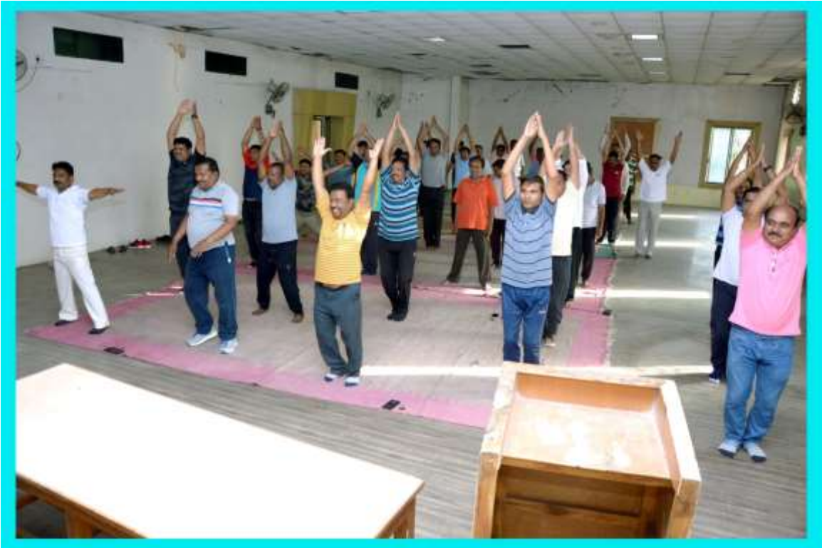
Staff participation in yoga day