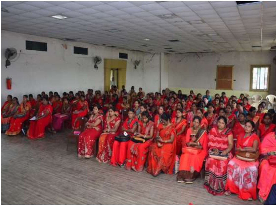
Official Women of Bachat Gat from different villages participated in workshop