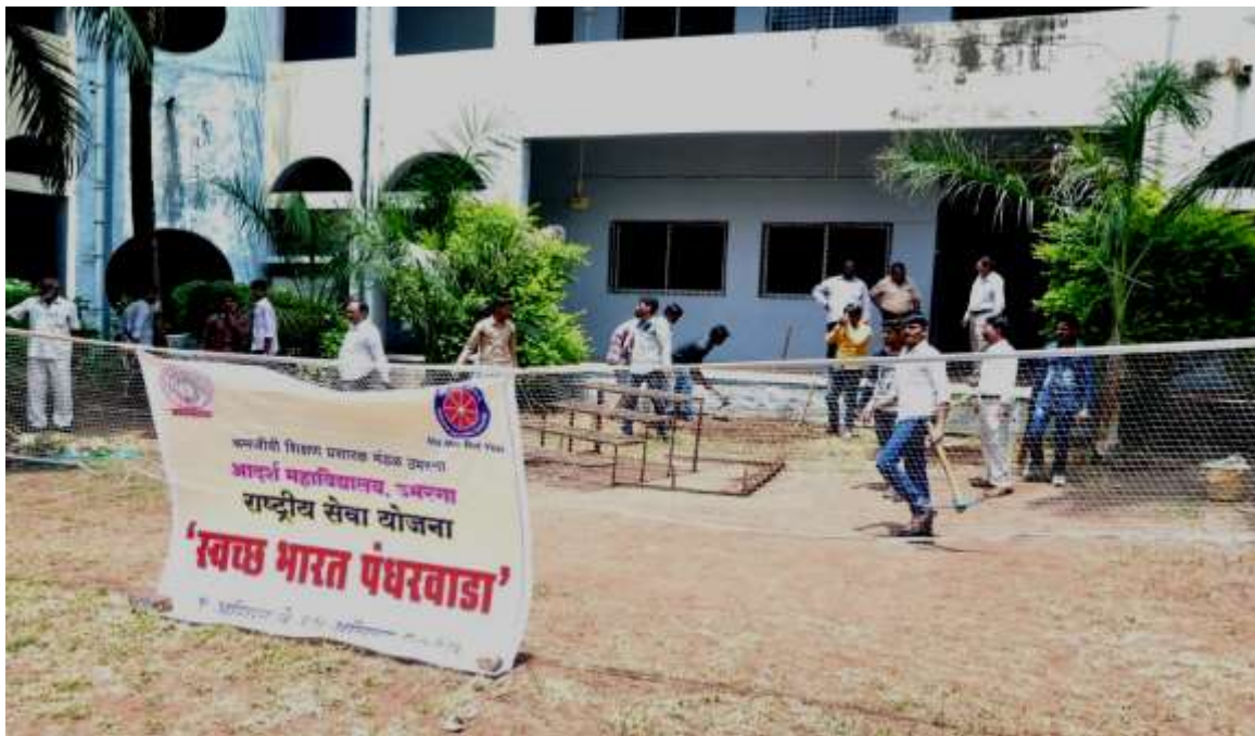
NSS students in Clean India movement Program