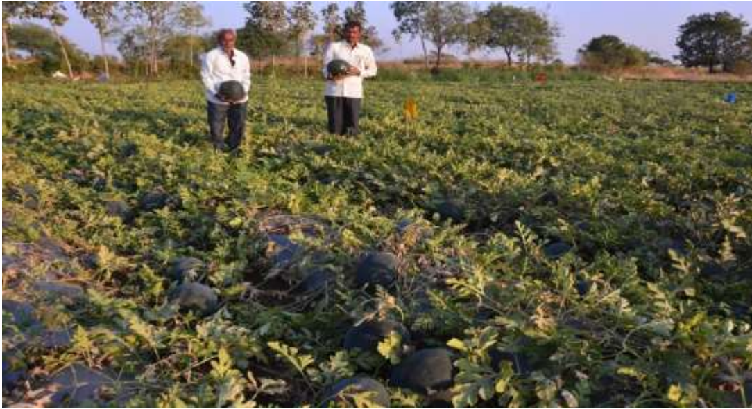
Botany teachers guided to farmers for management of crops