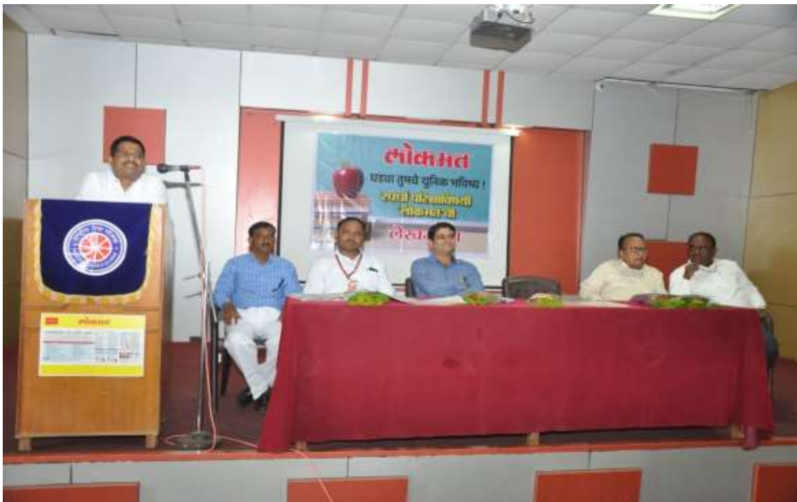
Competitive Exam Guidance Program