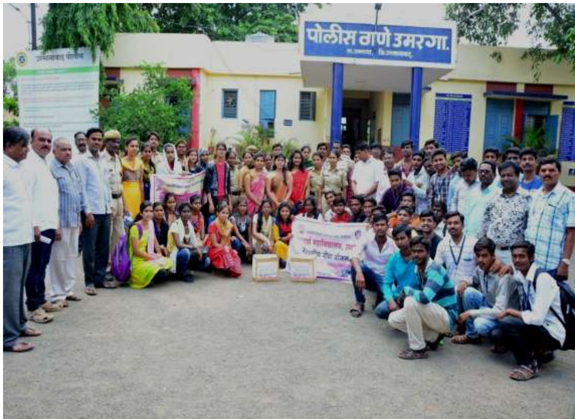
NSS students participated in money collection rally for flood affected farmers