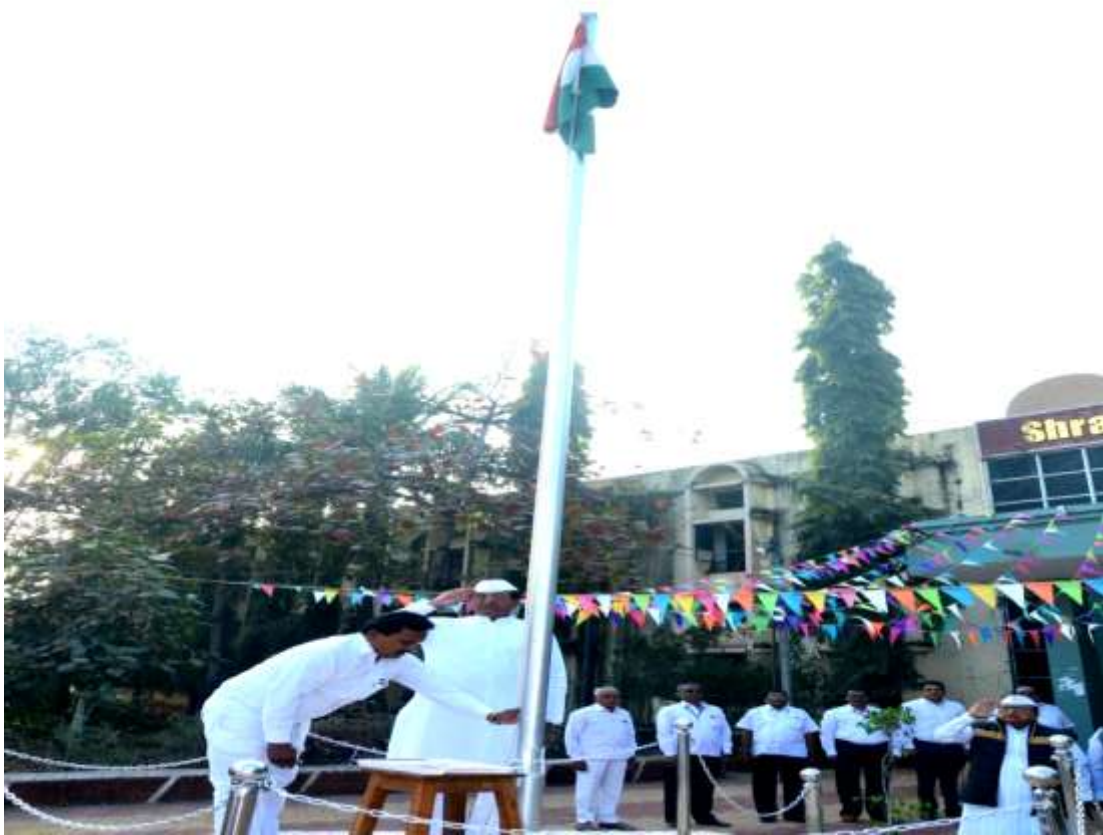
President our Education Society Flag Hosting in Republic day