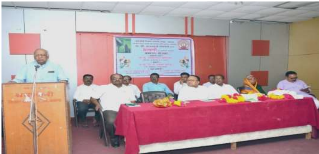
Marathi Book Publication Program