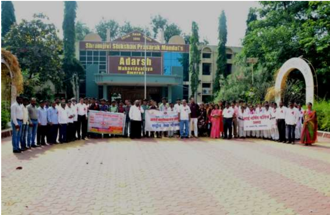
AIDS AWARENESS RALLY