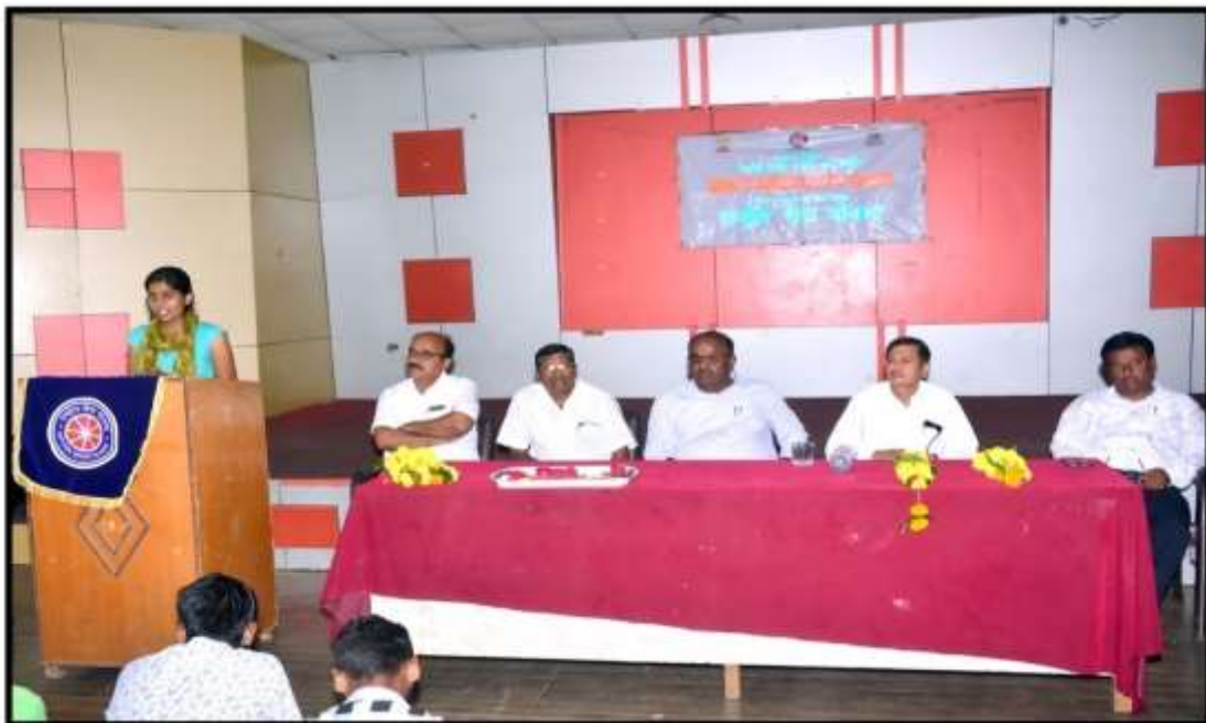
GIRL STUDENT SPEECH ON THE OCCASSION OF TEACHER'S DAY