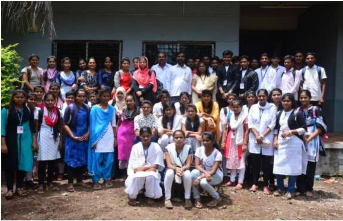
STUDENTS GOING TO PARTICIPATE IN UNIVERSITY YOUTH FESTIVAL