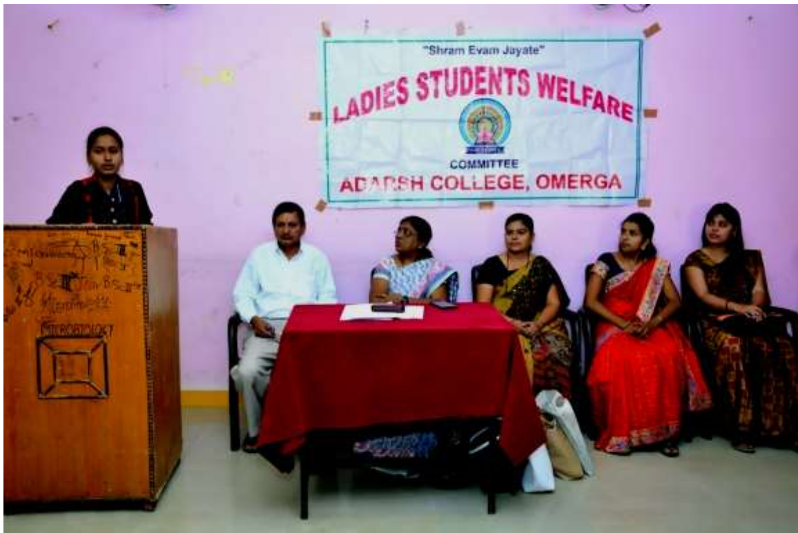
Girl student expressing her views in the Ladies Students Welfare Program