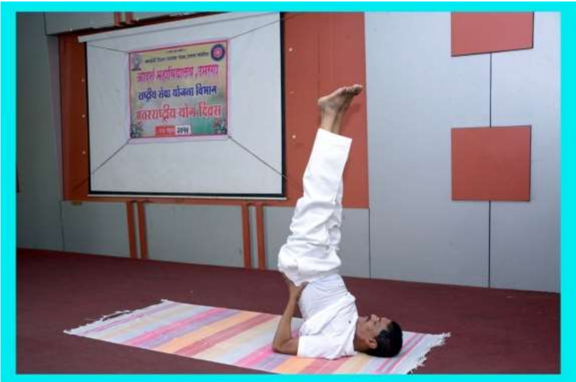
One of our staff member showing yoga positions on the occasion of Yoga Day