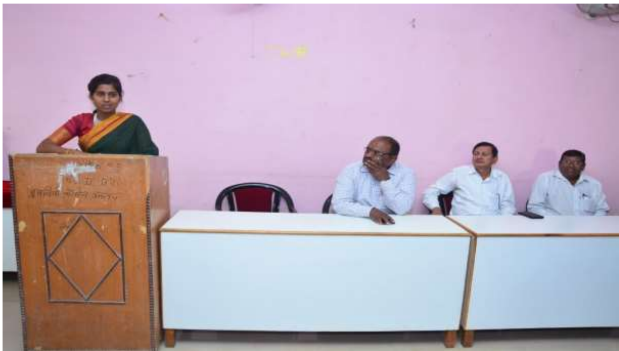
Girl student expressing her views on the occasion of Birth anniversary program eminent personalities