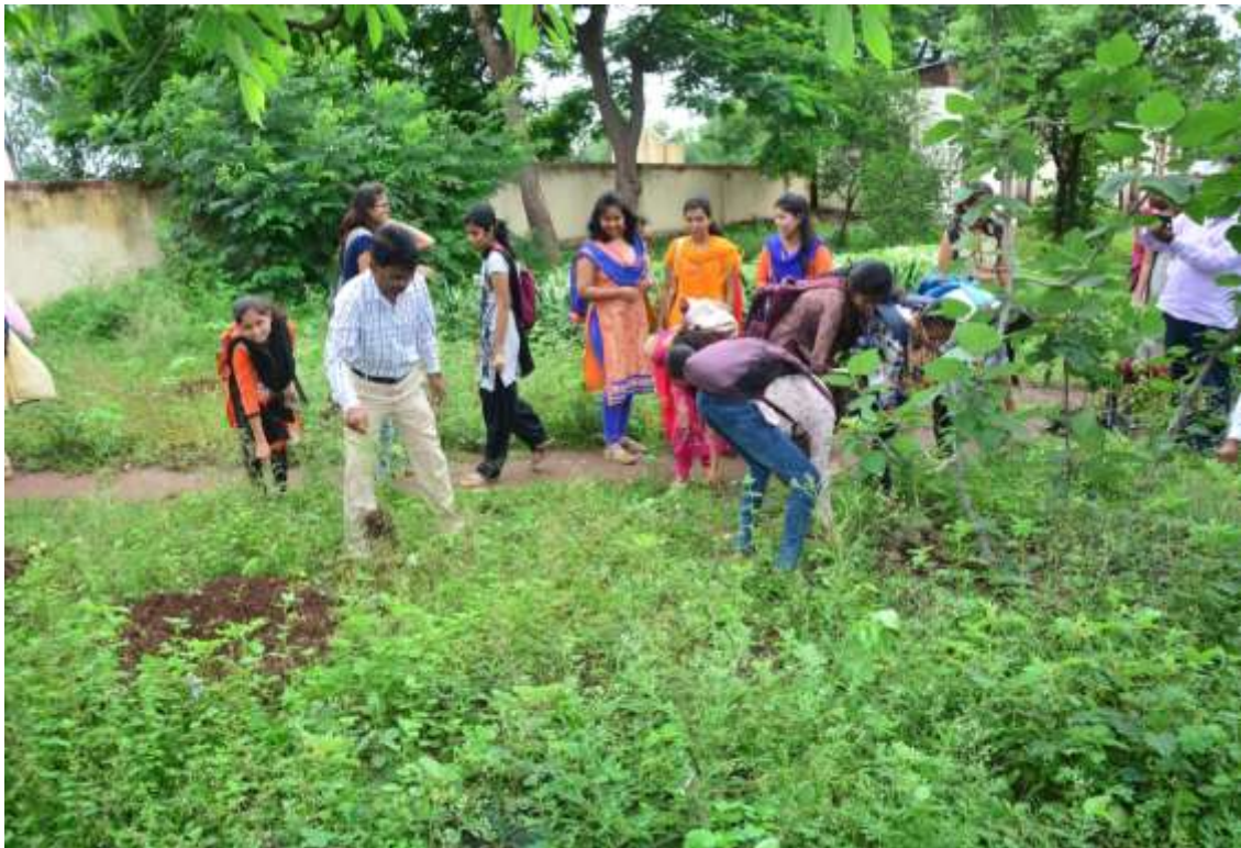
PLANTATION IN COLLEGE CAMPUS